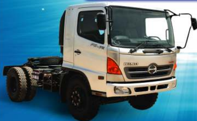
FG1J PM (4X2)