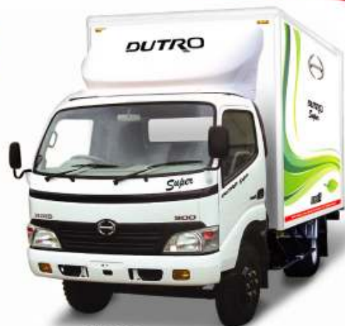
High Power DUTRO Super

Apart from it, Hinopak has also introduced High Power Dutro Super with superior features inclusive of extra engine power and high gradeability.