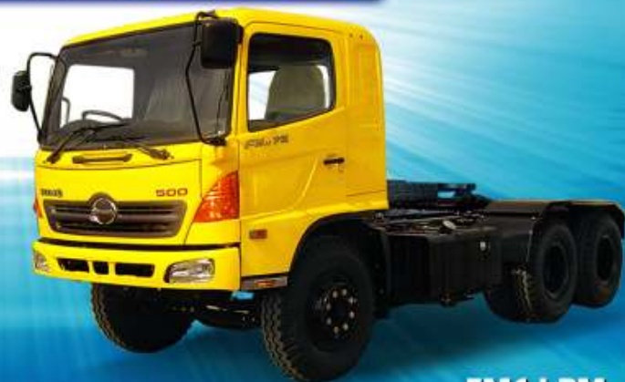
FM1J PM (6X4)

Enjoy the warranty on New Prime Movers by Hinopak