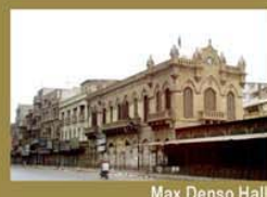
Max Denso Hall