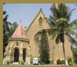
Saint Andrew's Church