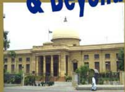
Victoria & Albert Museum