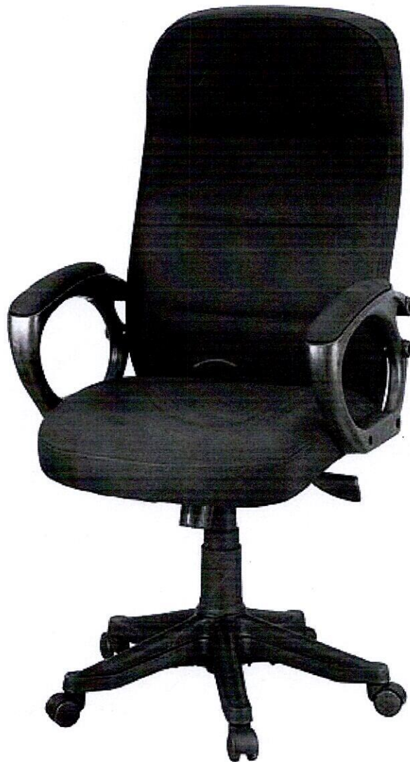
Boss B-524 Horizon High Back Revolving Executive Computer Chair, Black in Color