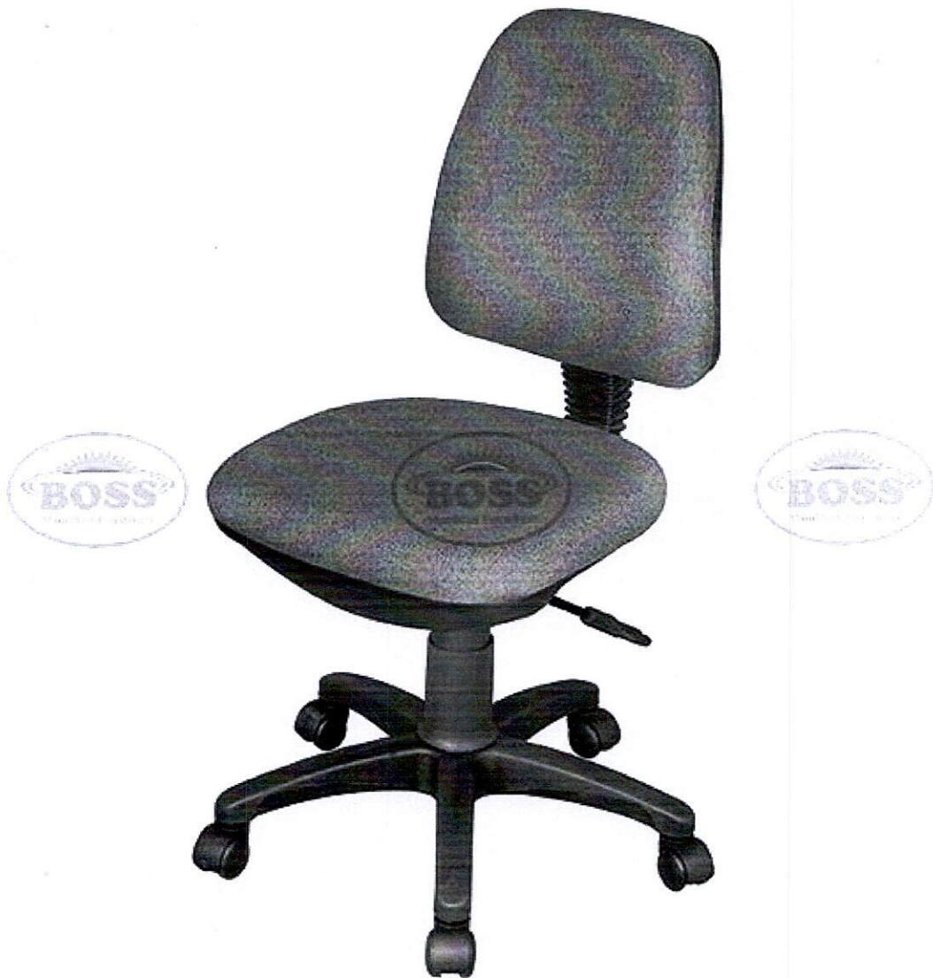
Boss B-508 Computer Chair with Hydraulic Jack without Arms with Stopper, Green Color