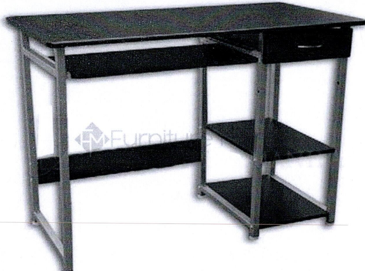
PICTORIAL SAMPLE FOR ITEM4 " WORKSTATION TABLE