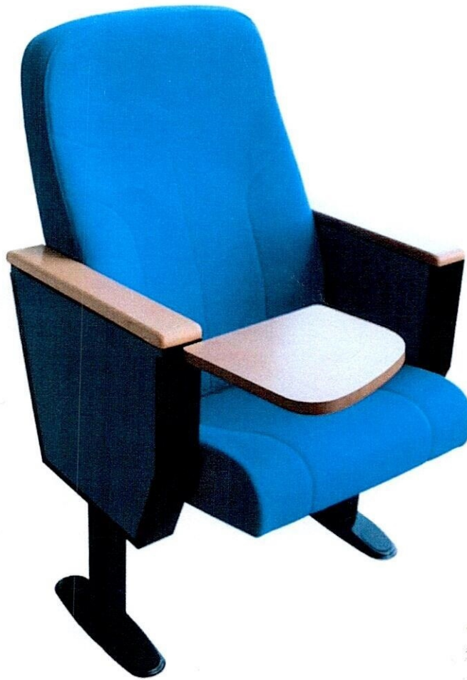
Drawing No. 1 (Seminar Hall Chairs)